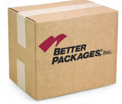
Carton sealed with Better Pack Tape and the BP 333 Plus